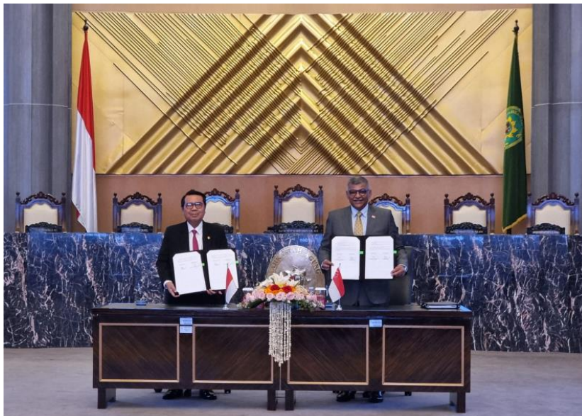
Chief Justice Prof Dr Muhammad Syarifuddin and Chief Justice Sundaresh Menon at the Memorandum of Understanding for Judicial Cooperation signing ceremony.