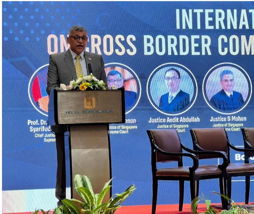
Chief Justice Sundaresh Menon delivering the keynote address at the International Seminar on Cross Border Dispute Resolution.