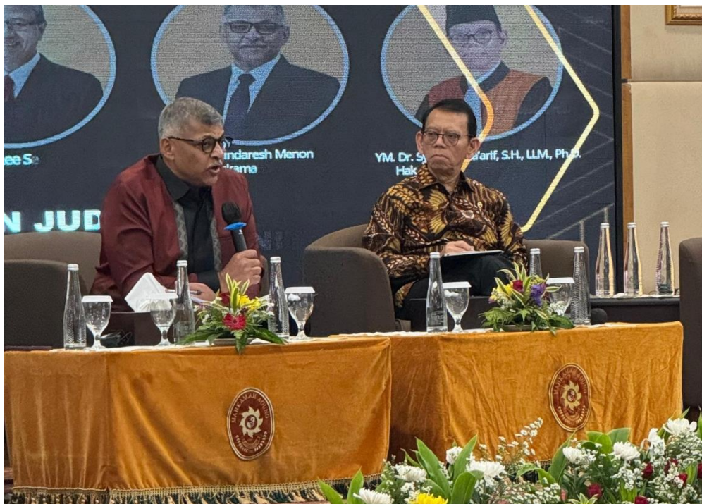
Chief Justice Sundaresh Menon and Justice Syamsul Maarif of the Supreme Court of Indonesia at a fireside chat with Indonesian judges and judicial training participants at the Judicial Training Centre.