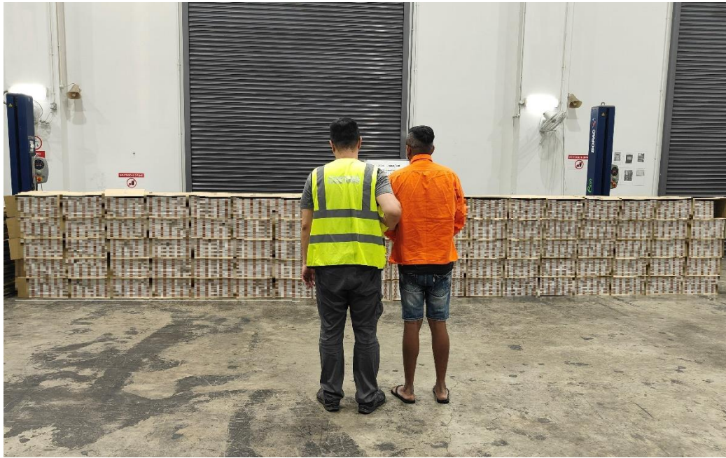
The man arrested at Marine Parade Central and the duty-unpaid cigarettes seized