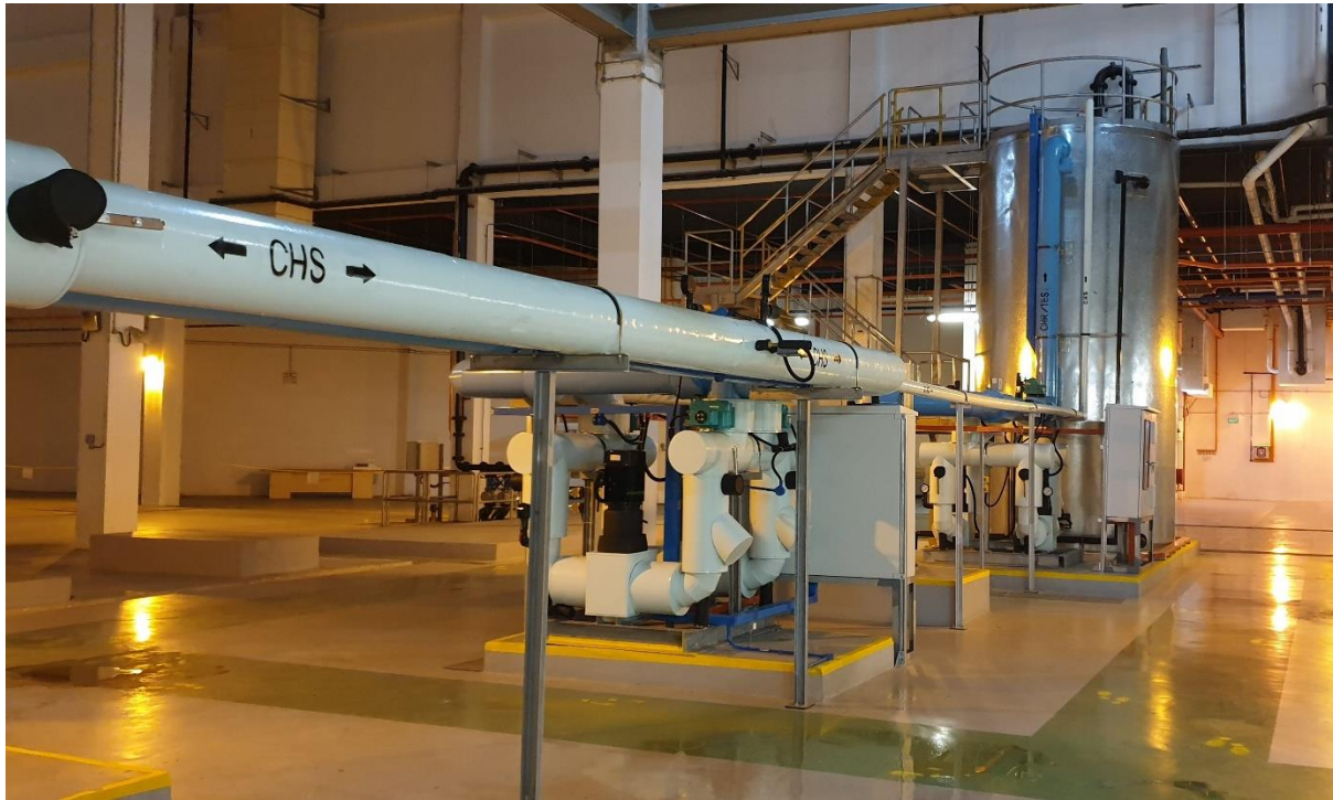
The Phase-Change Material thermal energy storage system installed at Keppel DHCS' Changi Business Park District Cooling Systems plant.