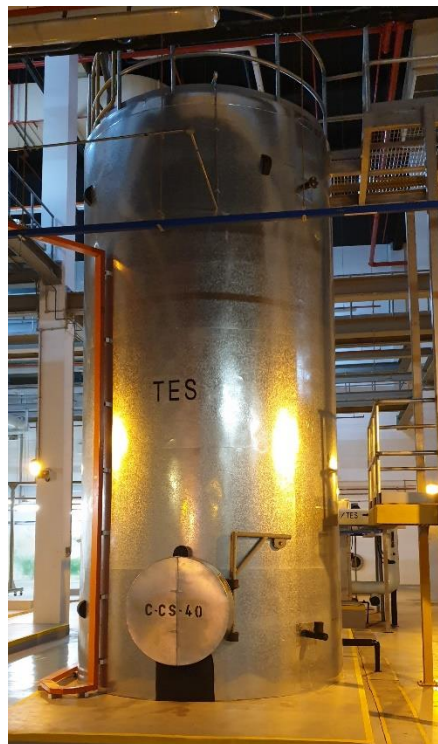
The Phase-Change Material thermal energy storage tank