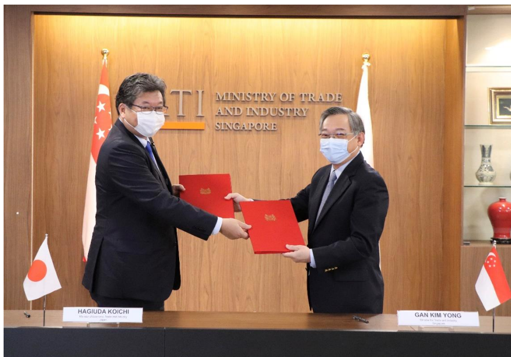
Minister for Trade and Industry Gan Kim Yong and Japan's Minister of Economy, Trade and Industry Hagiuda Koichi signed a Memorandum of Cooperation on Low Emissions Solutions.